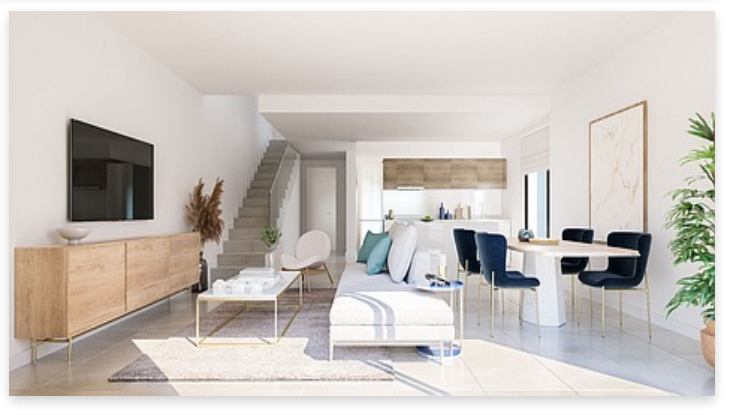
Semi-detached houses in Riviera del Sol, Mijas, with views over the mediterranean

Location: Mijas Price: 444,000 € - 461,000 €